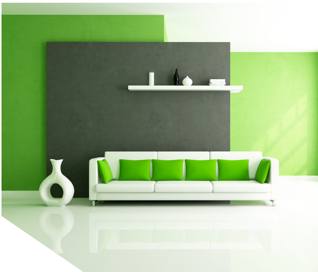
Modern interior space and furnishings.

SUNDIAL can powder coat the whole universe of unique and varied furnishing for high-end interior design. From tables and chairs to shelves, statuary, 3D art, room dividers and walls, SUNDIAL powder coatings provide the color variety, depth, texture and lasting beauty that high-end interior spaces yearn for.