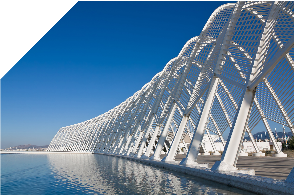
Large architectural structure.

SUNDIAL has special handling protocols in place for reliably processing large architectural components including beams, supports, enclosures, gates, fencing and other ferrous and non-ferrous building elements. No job is too big or too demanding. Call us to discuss your toughest jobs—we're up for the challenge.