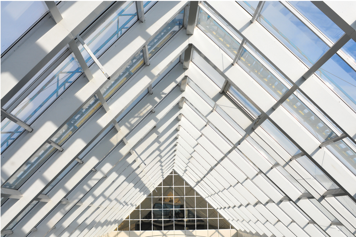
Steel and glass architectural roofing system.

SUNDIAL's high-performance powder coating technology is an ideal solution for architectural roofing systems. Wherever color and coating integrity are as important as weatherability and lasting beauty, there's no equal to the benefit and long-life value of SUNDIAL high-performance powder coating.