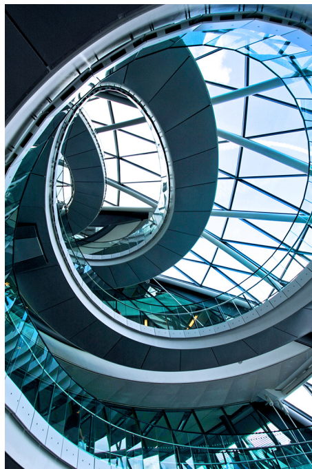
Steel, glass and aluminum architectural.

SUNDIAL weatherability is based on a Florida exposure South of latitude 27° North at a 45° angle, facing South - RAL 8014