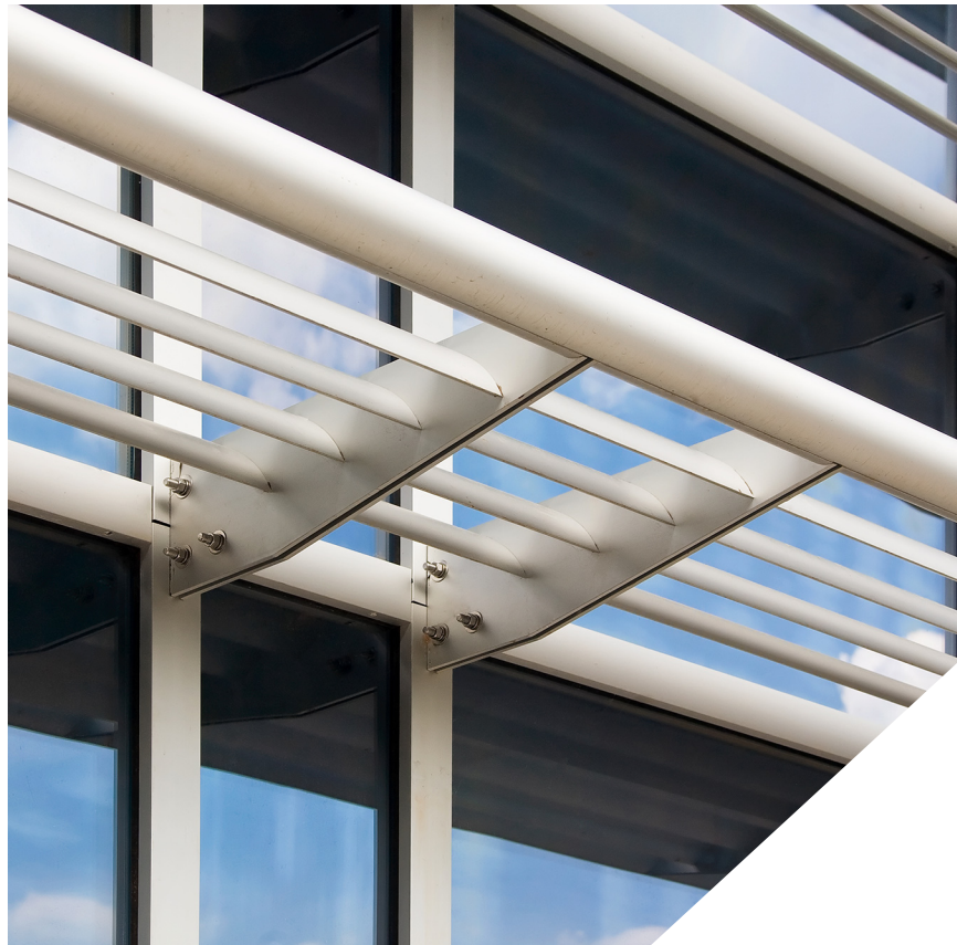
Aluminum and steel window louver system.