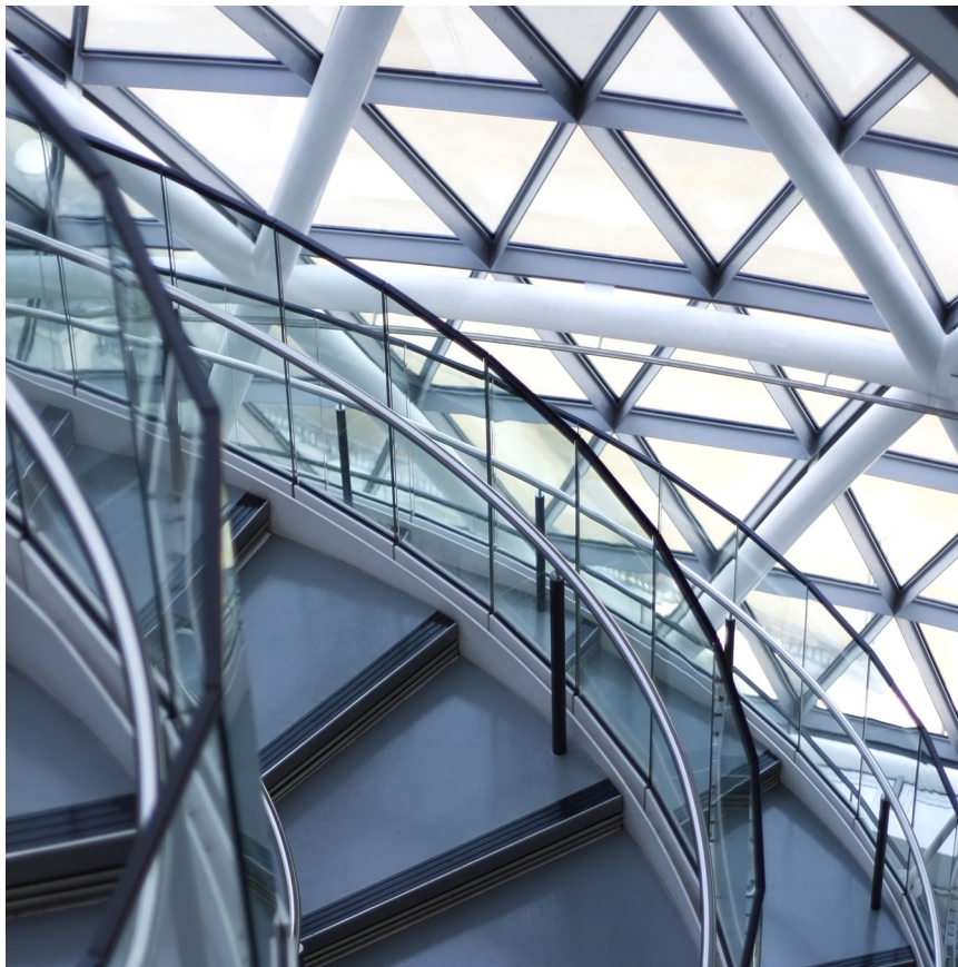
Steel and aluminum interior architectural elements.

SUNDIAL can powder coat any size, shape or surface of precision formed architectural metal with a durable, dull, high-gloss or textured surface that will appeal to all the senses. Our advanced powder coating technology delivers the color, gloss and life-long durability high-end architectural materials demand.